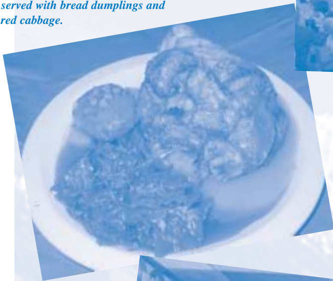
Schweine Haxe is one of the specialties on our Winter Karte that guests look forward to with great anticipation. The hamhock is slow roasted to give it the crispy skin that is brushed with Salvator Doppelbock. It is traditionally served with bread dumplings and red cabbage.