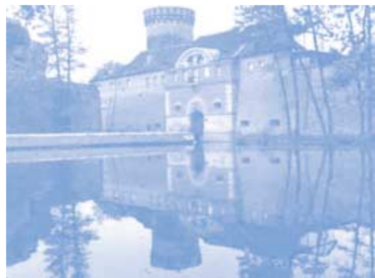
Zitadelle Spandau is one of the very few old buildings left in Berlin. Construction was completed in 1596. Today parts of the building serve as a museum while art exhibitions are held within the fortress.

"It was really easy getting around the Berlin area, which has a fabulous metro system," John said. "We took the train virtually all of the time. I never rode in a taxi at all. The intercity train system in Germany is also traveler friendly. Just following the signs makes it easy to get to your destination."