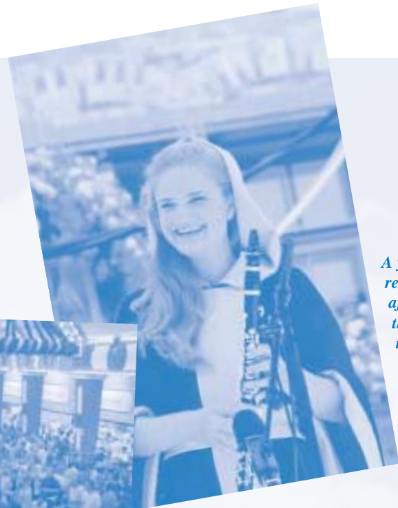
A young woman rests a moment after joining in the music at an informal concert on the Oktoberfest grounds in München.