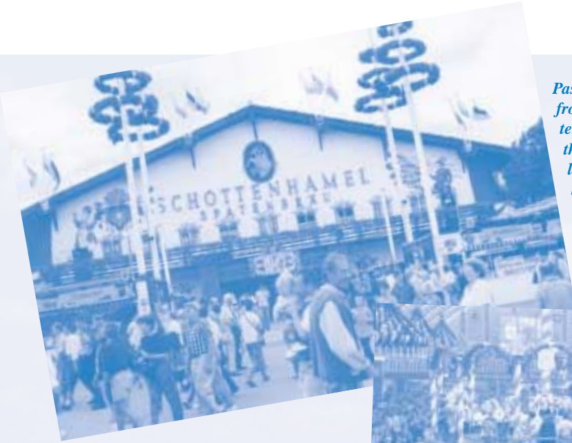
Passersby are seen in front of the Spaten Beer tent on the grounds of the Oktoberfest. Many large German breweries have tents set up to attract the thousands of Bier drinkers.