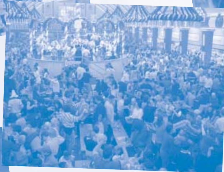
Large crowds of revelers gather in one of Bier tents at the annual 15-day München Oktoberfest. They listen to the bands, sing, eat huge amounts of chicken and sausages, and drink thousands of liters of Oktoberfest Biers.