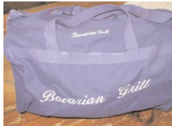
Gym bag — 25 points