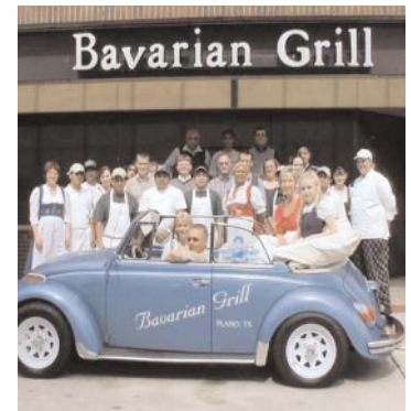
The Bavarian Grill Team Members are ready to make your next visit pleasant. Our Goal is for you to leave smiling, wanting to return soon with all your friends!