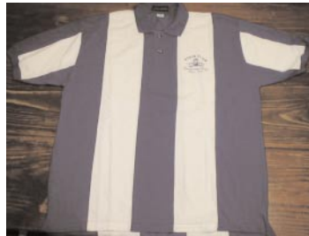
Royal-white rugby shirt — 35 points